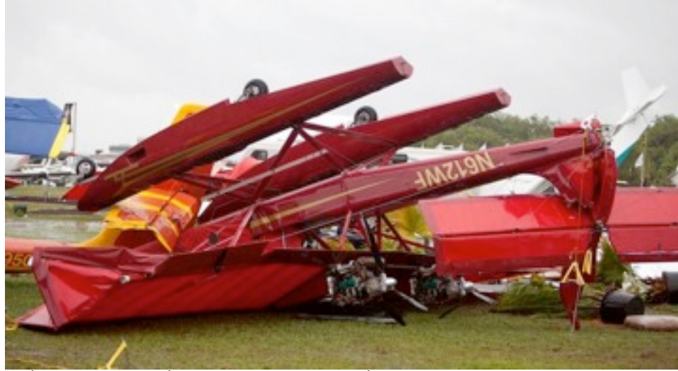
This lovely Minnesota-based Air Cam landed atop another aircraft during the onslaught.