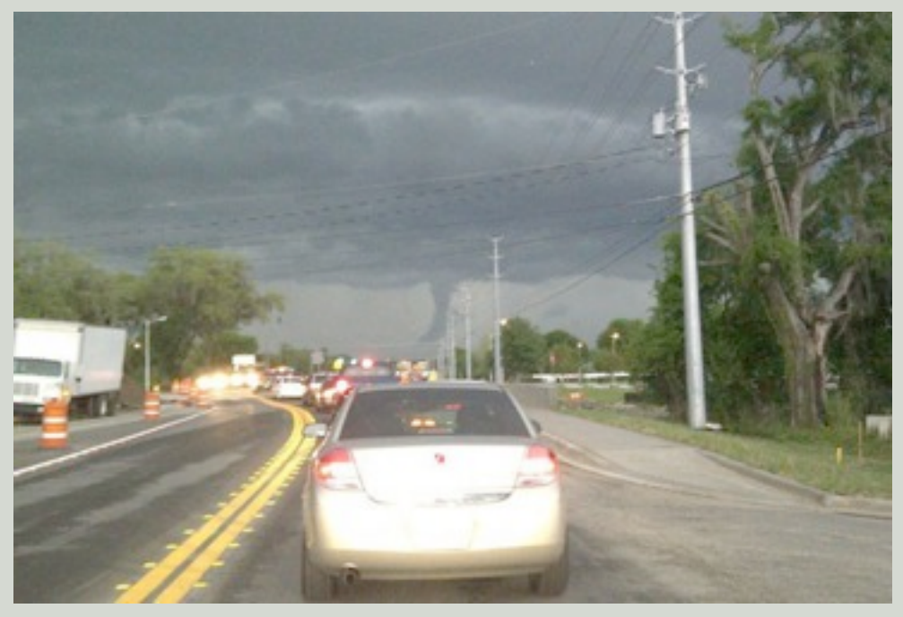
Motorists captured this photo of the tornado, working its way to the airshow.