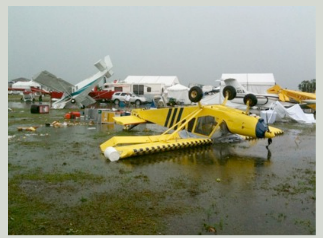
A bad day for Zenith aircraft: STOL models prove the worst off, when the winds accelerate, for obvious reasons.