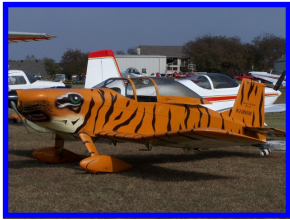
Seen at Fall 2007 Fly-In