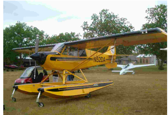
AVIAT HUSKY AMPHIBIAN